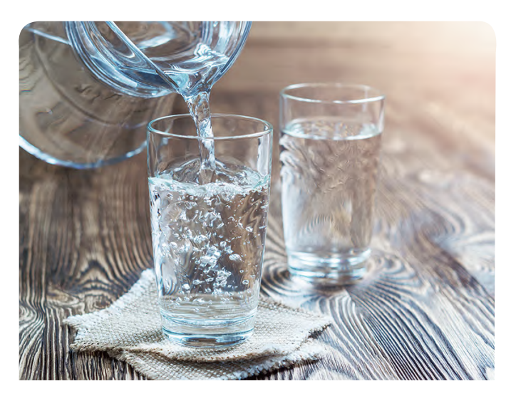
(continued on page 9)