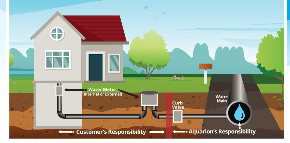
Customer and Aquarion responsibilities shown are representative for most customers.

A service line is the pipe that connects a customer's premises to Aquarion's water main in the street (see illustration above). Homes built before 1986 may have lead service lines (with a few exceptions, most were installed in