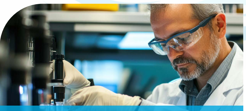
This system was tested for PFAS compounds but none were detected in 2023.

Unregulated contaminants are elements that currently have no health standards assigned for drinking water. No PFAS compounds were detected in your system. To learn about the full list of unregulated contaminants included in the monitoring program, please visit www.epa.gov/dwucmr.