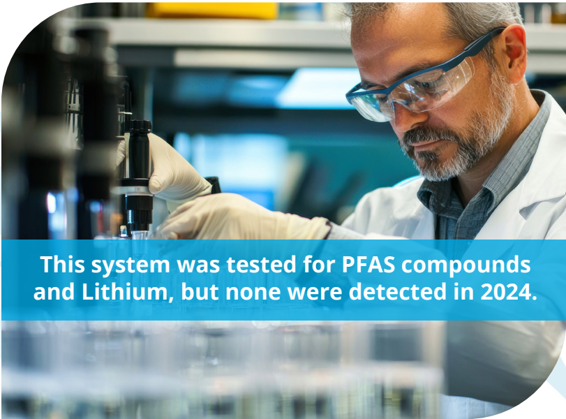
This system was tested for PFAS compounds and Lithium, but none were detected in 2024.

As required by EPA's Unregulated Contaminant Monitoring Rule 5 (UCMR5), our water system has sampled for a series of unregulated contaminants. Unregulated contaminants are those that don't yet have a drinking water standard set by EPA. The purpose of monitoring for these contaminants is to help EPA decide whether the contaminants should have a public health protection standard. No PFAS compounds or Lithium were detected in your system. For additional information about these unregulated contaminants, please contact our Water Quality Department at 800-832-2373 or visit EPA's UCMR website at epa.gov/dwucmr .