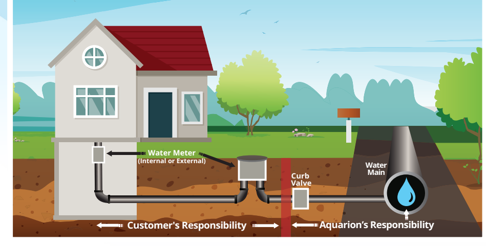
Customer and Aquarion responsibilities shown are representative for most customers.

A service line is the pipe that connects a customer's premises to Aquarion's water main in the street (see diagram on page). Homes built before 1986 may have lead service lines (with a few exceptions, most were installed in homes built before 1930), and those built before 1986 may have lead solder and brass fittings (which may have a lead content).