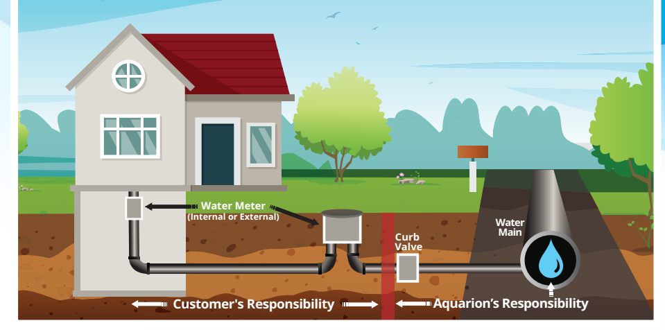
Customer and Aquarion responsibilities shown are representative for most customers.

A service line is the pipe that connects a customer's premises to Aquarion's water main in the street (see diagram on page). Homes built before 1986 may have lead service lines (with a few exceptions, most were installed in homes built before 1930), and those built before 1986 may have lead solder and brass fittings (which may have a lead content).