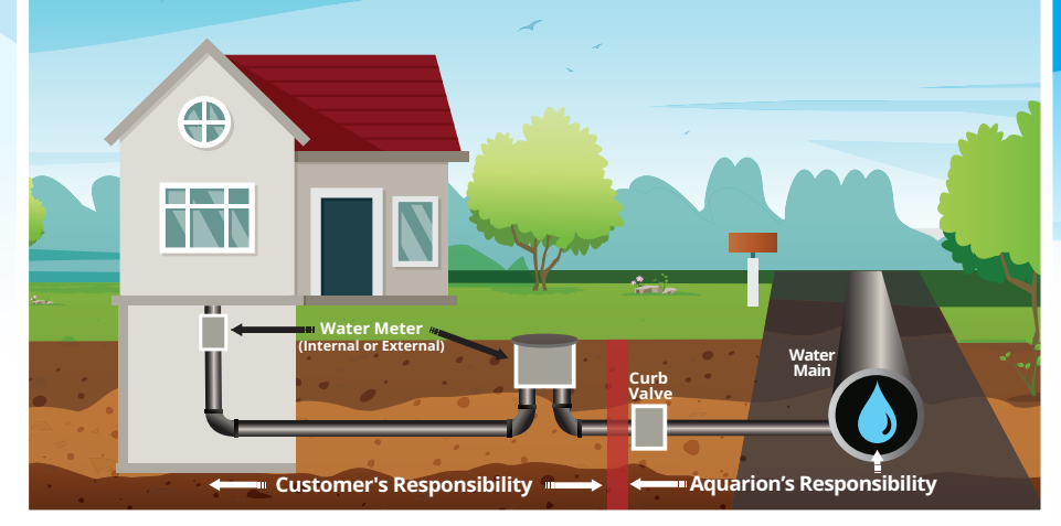
Customer and Aquarion responsibilities shown are representative for most customers.

A service line is the pipe that connects a customer's premises to Aquarion's water main in the street (see diagram on page). Homes built before 1986 may have lead service lines (with a few exceptions, most were installed in homes built before 1930), and those built before 1986 may have lead solder and brass fittings (which may have a lead content).