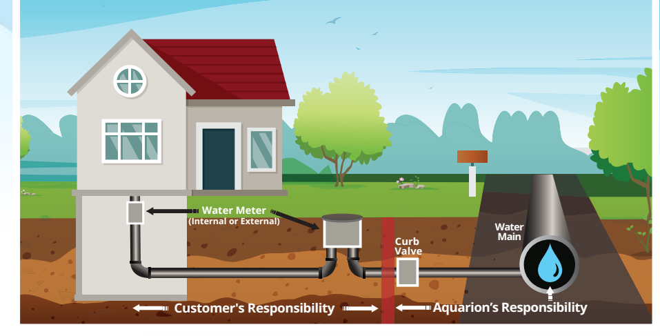
Customer and Aquarion responsibilities shown are representative for most customers.

A service line is the pipe that connects a customer's premises to Aquarion's water main in the street (see diagram on page). Homes built before 1986 may have lead service lines (with a few exceptions, most were installed in homes built before 1930), and those built before 1986 may have lead solder and brass fittings (which may have a lead content).