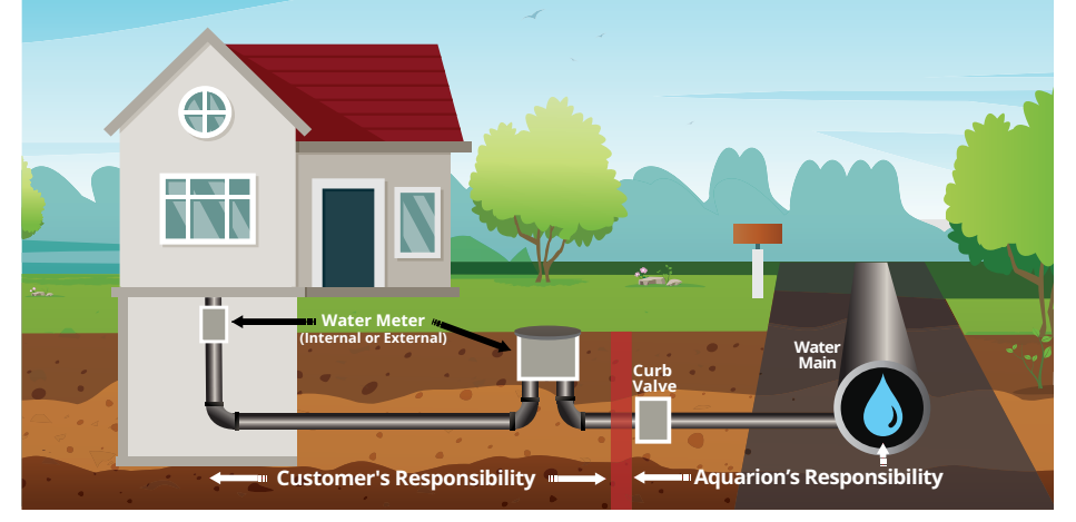
Customer and Aquarion responsibilities shown are representative for most customers.

A service line is the pipe that connects a customer's premises to Aquarion's water main in the street (see illustration above). Homes built before 1986 may have lead service lines (with a few exceptions, most were installed in