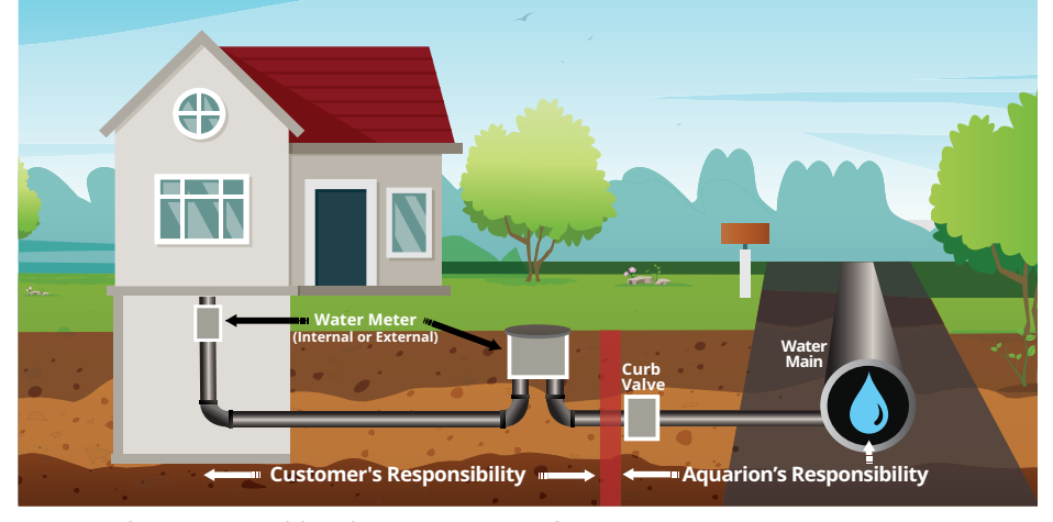
Customer and Aquarion responsibilities shown are representative for most customers.

A service line is the pipe that connects a customer's premises to Aquarion's water main in the street (see illustration above). Homes built before 1986 may have lead service lines (with a few exceptions, most were installed in