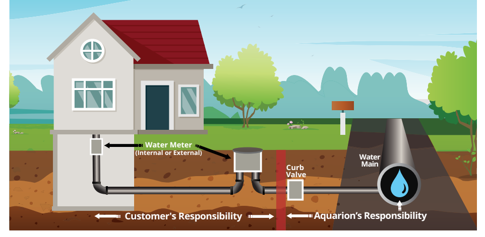
Customer and Aquarion responsibilities shown are representative for most customers.

A service line is the pipe that connects a customer's premises to Aquarion's water main in the street (see illustration above). Homes built before 1986 may have lead service lines (with a few exceptions, most were installed in