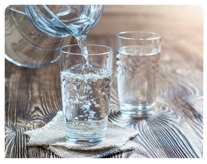
(continued on page 9)