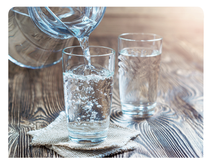
(continued on page 9)

• Radioactive contaminants that can be naturally occurring.