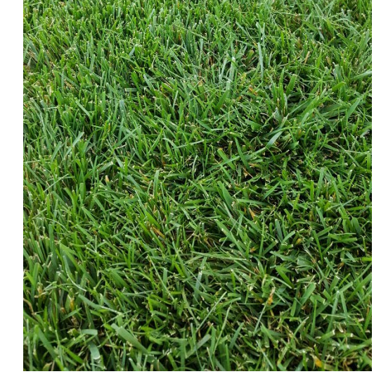
Bunch-type grasses, such as turf-type tall fescue, do not develop significant levels of thatch.

• Select and incorporate turfgrass species or cultivars that produce less thatch: Bunch-type grasses, such as perennial ryegrass and turf-type tall fescue, do not develop significant levels of thatch.