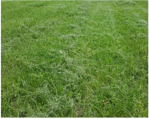
Leave grass clippings on the lawn after mowing for a natural boost of nutrients to the soil. Disperse clippings to avoid clumping on turfgrass surface.