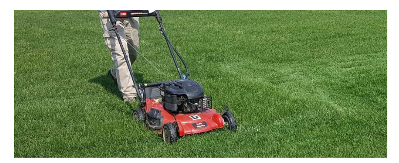
Mow regularly all season at a consistent height of cut.

cut, particularly in spring and fall, when turfgrass growth is most active. Remove no more than 1/3