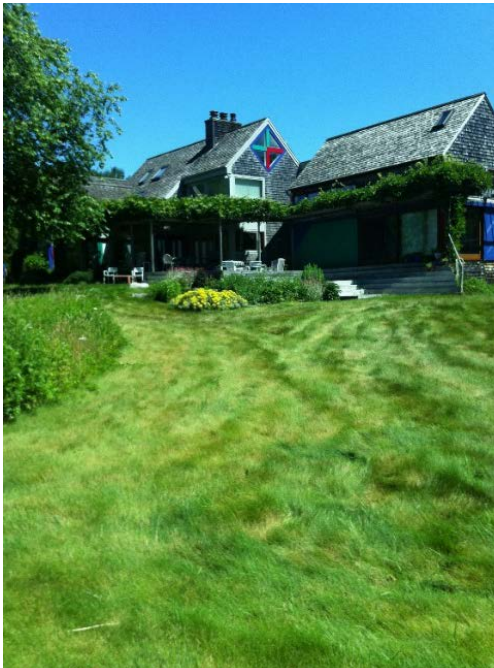
This low-maintenance, healthy lawn is planted with drought tolerant grass species and cultivars.

For seeding all new lawns or overseeding of established lawns, select turfgrass species and cultivars that have improved drought tolerance. Deep root systems and low rates of evapotranspiration (the sum total of water lost to the atmosphere from both evaporation from the soil surface and transpiration from leaf surfaces) are important factors that support turfgrass drought tolerance. For general health, once established, turftype tall fescue and fine fescues require less water than perennial ryegrass and Kentucky bluegrass. They should be incorporated into most lawn mixtures whenever possible. Always overseed newer turfgrass cultivars with improved tolerance for drought stress into existing lawns. Contact Extension specialists for help identifying improved cultivars.